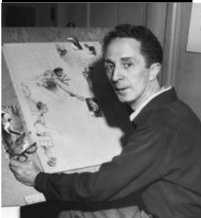
Norman Rockwell Artist