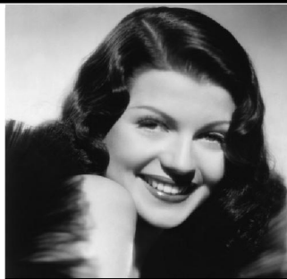
Rita Hayworth Actress